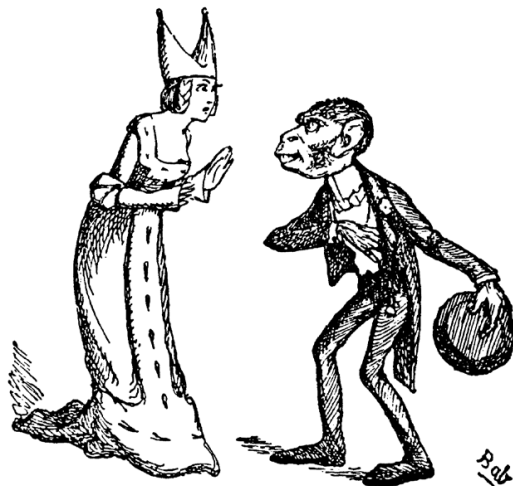
A Lady fair of lineage high