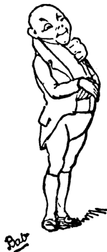
Whene'er I spoke sarcastic joke