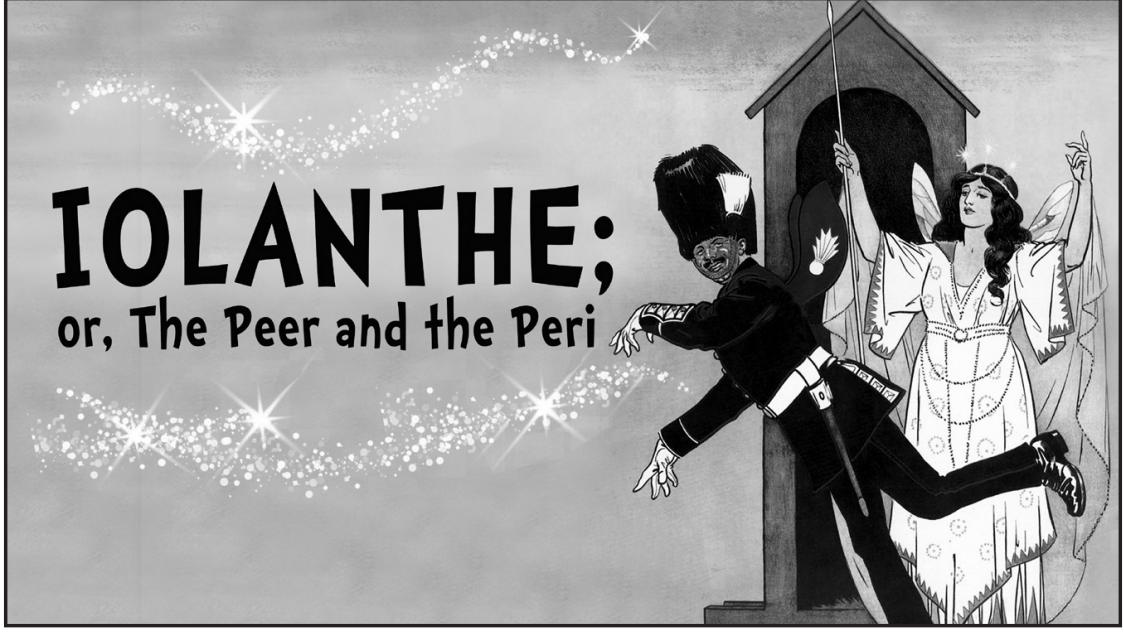
May 19Iolanthe's Fractured Fairy TalesMusicaleJune 13-23Iolanthe summer production

For more information on these and other GSA activities, please visit www.gilbertsullivan.org