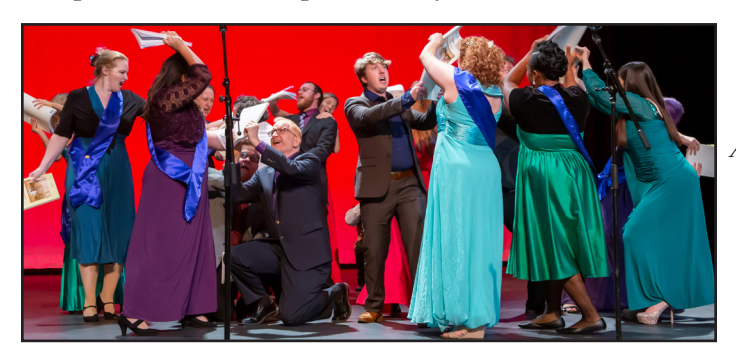
the Battle of Castle Adamant, as Princess Ida's students and professors fend off King Hildebrand's soldiers