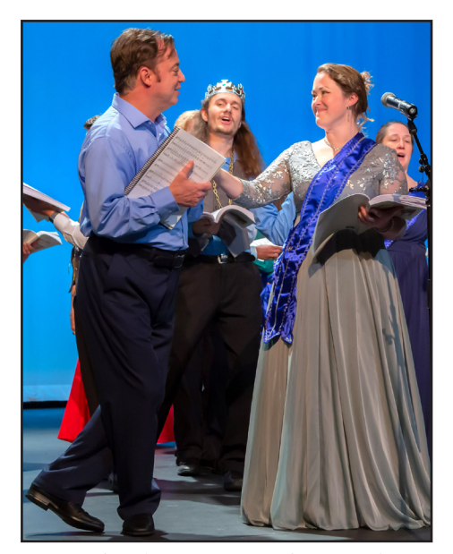
Princess Ida at last consents to wed Prince Hilarion