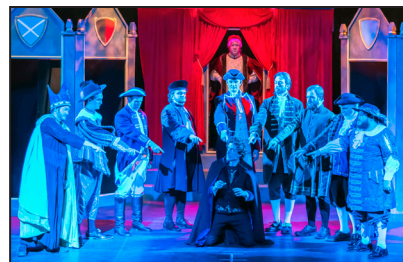
ghosts of his ancestors threaten Robin Oakapple, a.k.a. Sir Ruthven