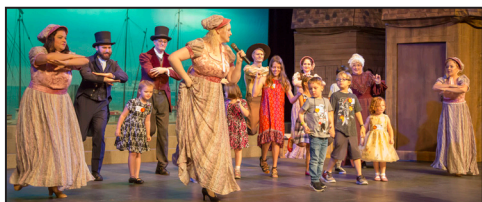
children's activities before the first matinee