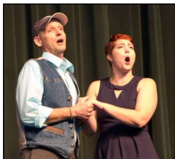
Tonio and Marie

The Marquise de Berkenfield was immediately taken by her niece's beautiful voice, and declared that she would take Marie with her so that she could study music with the best teachers. Sadly, this meant that Marie and Tonio, with whom she had grown up and had fallen in love, would be parted from each other. Before their farewell, Tonio proclaimed his love for Marie and promised to provide for and love her