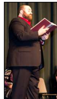
Leporello Dolce Bello

Frau Fior Fortissimo first showed Marie how shameful it was for Tonio to attempt to prevent Marie from attaining the diva status she so deserved with "Come scoglio" from Mozart's Così fan tutte . To add fuel to the fire of depicting Tonio in a negative light, the next opera star, Leporello Dolce Bello, said there was no doubt that Tonio was a great womanizer who probably had a woman at every port. He provided more details to Marie in "Madamina, il catalogo è questo," also known as the "Catalogue Aria," from Mozart's Don Giovanni .