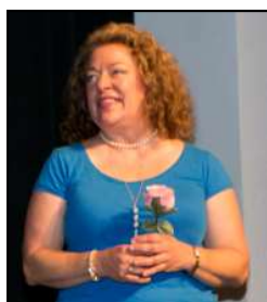
Marquise de Berkenfield

Next, we met Marie's aunt, the Marquise de Berkenfield, who had finally found her long-lost niece at the orphanage after many years of fruitless searching. The poor Marquise bemoaned the fact that she had been wandering everywhere looking for her precious niece for so many years. Her niece, so happy to have been found at last by her aunt, broke into song and offered us "Poor wand'ring one" from The Pirates of Penzance .