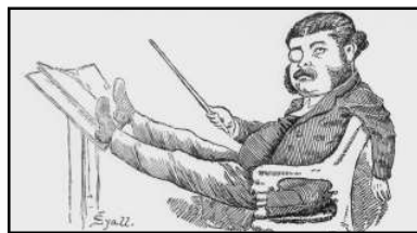
Sir Arthur Sullivan as a conductor, sketch by Charles Lyall, c. 1879

Number Threeeeeeee! “The Electricity,” which Richard D’Oyly Carte had installed in the new Savoy Theatre six years before Ruddigore , must have made the darkening of the stage necessary for the portraits’ transformations easier than it would have been with the old gas lighting. And it also had its influence on the musical side of the production, for on the opening night Sullivan conducted the “ghost music” as the lights dimmed to dark with a special baton graced with a glowing filament so that his orchestra could follow his direction.