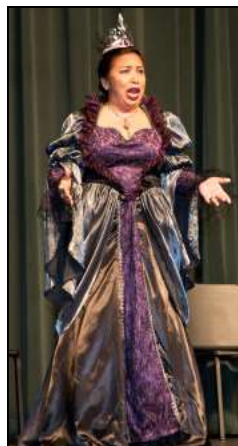
Duchess of Krackonanay

forever with "There was a time" from The Gondoliers . However, the Marquise was a woman of means and objected to any union between her niece and the lowly orphan.