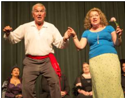
Sulpice and the Marquise

The Marquise was indeed moved by his singing, but although Marie said she would die without Tonio, the Marquise would not believe that anyone would die of love. Sulpice told the Marquise that she did not know of what she spoke and sang "Titwillow" from The Mikado . The Marquise asked Sulpice if the fellow from the song really died of love; when Sulpice said that the story rang true, she asked if he would do the same if she refused him as well. When he said yes, the Marquise told him that he mustn't do so, and asked that he not hate her for being a wee bit of an opera snob. "Is there not beauty even in opera snobbery?" Sulpice asked the Marquise. She agreed and they joined together for "There is beauty in the bellow of the blast" from The Mikado .