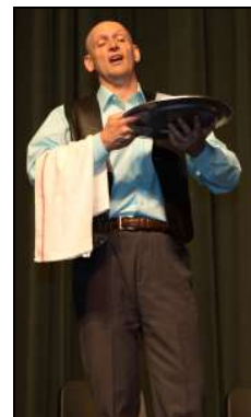
"First Footman" Tonio

The Duchess of Krackonanay explained to the Marquise that she needed money for her fledgling opera company. The Marquise had a wonderful idea and proposition for the Duchess: she would happily pay the Duchess and her best opera singers if they would train Marie to love and sing only grand opera. The Duchess liked the idea and called in her cadre of singers. They toasted and sang "Brindisi," also known as "The Drinking Song," from Verdi's La Traviata , and were so busy celebrating that they did not notice that a new "First Footman" had entered and been serving them. It was revealed that the new servant was none other than a disguised Tonio, who had followed his true love to Berkenfield. He reflected on his love for Marie as he sang "A maiden fair to see" from H.M.S. Pinafore . When the Marquise recognized Tonio, she sent him away. Duchess Krackonanay assured the Marquise that she and her cadre of opera stars would work together to show Marie how wrong Tonio was for her. To keep her from following Tonio, the Marquise insisted Marie listen to the advice of the talented singers. Marie reluctantly gave in to her aunt's wishes and readied herself for the afternoon's "lessons."