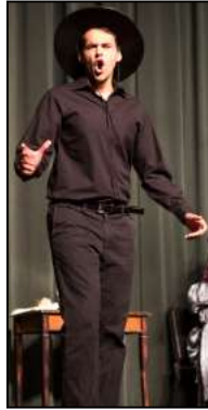
Count Zorro di Canto Grosso

Marie was very upset by the thought that Tonio could be such a cad. Although Marie had seen him every day in the orphanage and had known him so well, she was overcome with doubt and unable to see that this was all just a ploy to keep her from her beloved Tonio. Before common sense could assert itself, the next opera star, Charlotta Voce Grande, stepped forward and encouraged Marie to let her tears flow with "Va! Laisse couler mes larmes" from Massenet's Werther . The audience felt for poor Marie, who did not know how she would ever get over losing Tonio now. Count Zorro di Canto Grosso assured her that joy would follow sorrow as he sang "Sorge infausta" from Handel's Orlando .