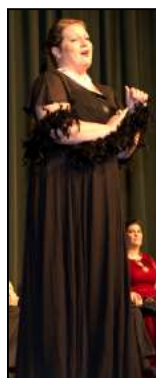
Frau Fior Fortissimo

Frau Fior Fortissimo first showed Marie how shameful it was for Tonio to attempt to prevent Marie from attaining the diva status she so deserved with "Come scoglio" from Mozart's Così fan tutte . To add fuel to the fire of depicting Tonio in a negative light, the next opera star, Leporello Dolce Bello, said there was no doubt that Tonio was a great womanizer who probably had a woman at every port. He provided more details to Marie in "Madamina, il catalogo è questo," also known as the "Catalogue Aria," from Mozart's Don Giovanni .