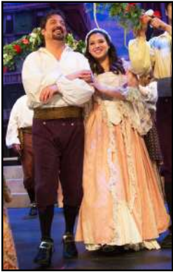
"Bridegroom and bride"

see more at gilbertsullivanatx.smugmug.com