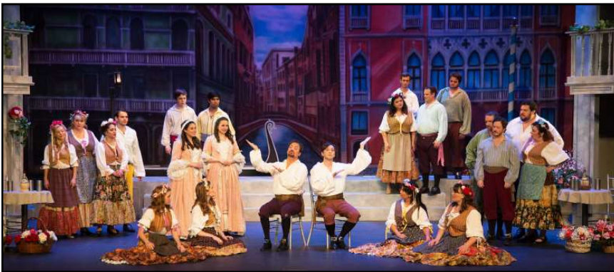
"We sing as one individual" (Act I Finale)