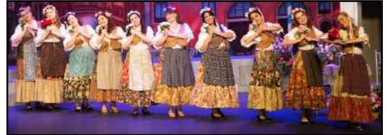
"List and learn"