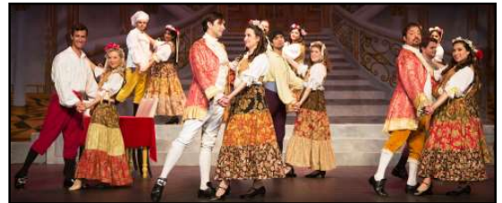
"Dance a cachucha"