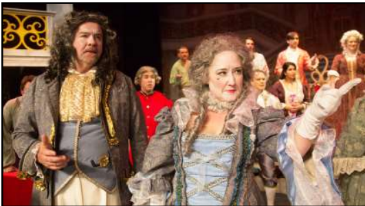
"Speak, woman, speak" (Act II Finale) Duke and Duchess