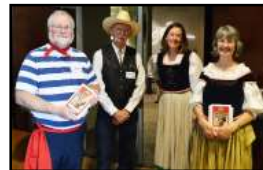
the ushers joined in the spirit of the show