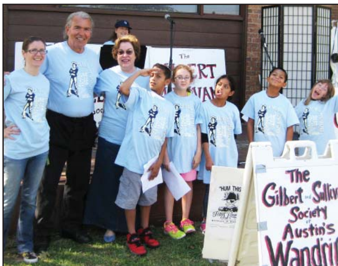
below, students and staff are drafted into performing with the Minstrels