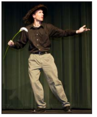
Bunthorne attracts the ladies