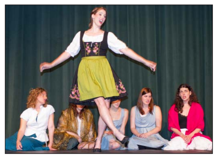
Patience wonders "What this love can be"