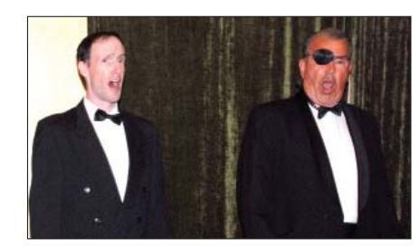
Sing Hey, the Merry Maiden and the Tar