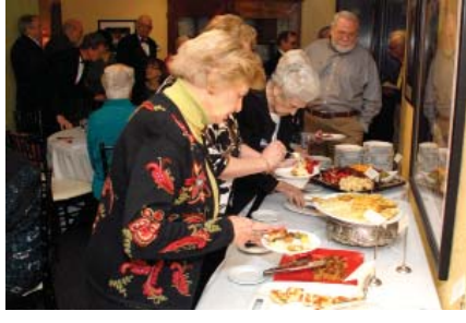
Chez Zee provides a delectable buffet