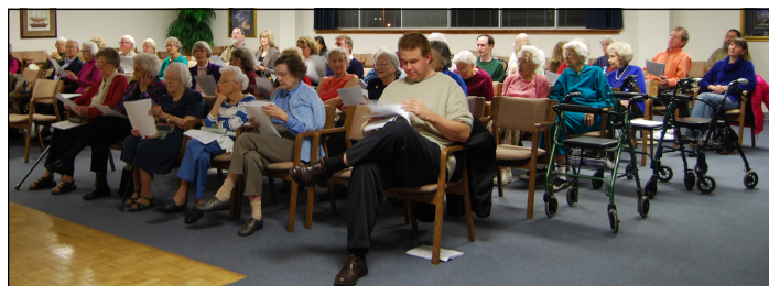
Members and guests share scores for an enthusiastic sing-along of Gilbert and Sullivan selections.