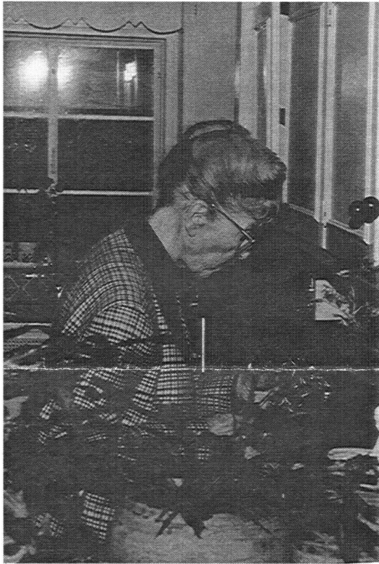
The Hostess with the Mostest Pearl in her kitchen