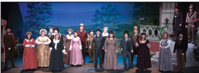
the Villagers of Ploverleigh