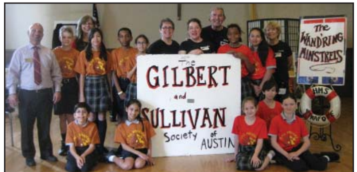
Staff and students from the Cathedral of St. Mary's enjoyed the visit by the GSSA's Wand'ring Minstrels (back row, in black shirts, l-r):

If you would like to have the Wand'ring Minstrels perform at your school, please see the web site, www.gilbertsullivan.org , for information.